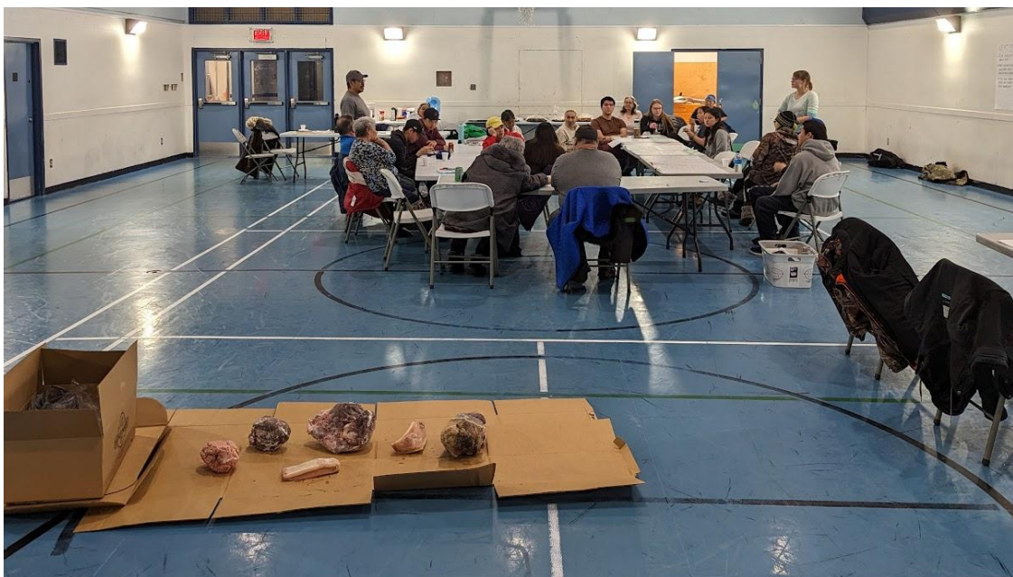
Students and elders listening to final remarks while waiting to share country food.